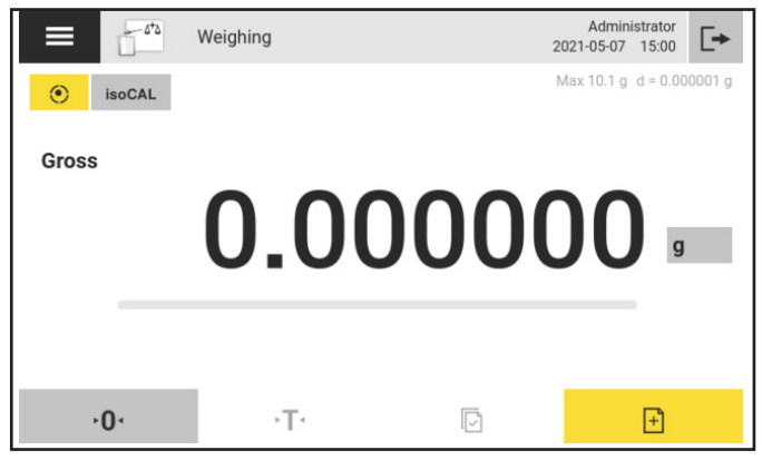
Figure 2. If the Safe Weighing mode is set to Warning and the isoCAL execution mode is set to Manual execution, the display buttons for leveling or isoCAL are highlighted yellow when the balance must be leveled or if an internal adjustment is needed. The yellow color provides the operator with direct visual feedback when an action is necessary to ensure proper weighing results. If the Safe Weighing mode is set to Strict, weighing measurement only begins once the balance is properly leveled or the internal adjustment is performed.

When the Safe Weighing mode is set to strict, weighing applications will not initiated if the balance is not properly leveled or an internal adjustment is needed. These automatic safeguards ensure the reliability of weighing results and provide peace of mind for the user.