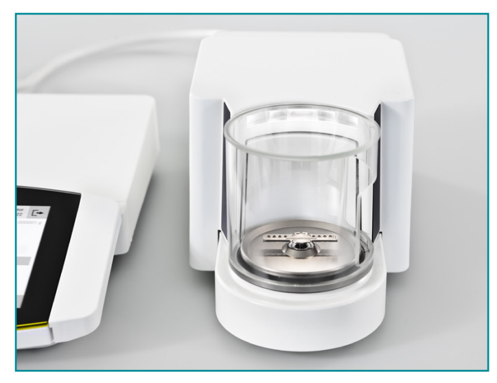
Figure 4. Microbalance weighing module with crystal clear glass draft shield and sample holder for stent weighing. The draft shield base plate and sample holder are made of titanium. The round, flat weighing pans with a diameter of 20/30 mm and 50 mm, which are part of the standard delivery contents, are also made of high-quality, non-magnetic titanium. The weighing chamber can be dissembled easily and within a few seconds for cleaning purposes.

Cleanability is also important for routine maintenance. Titanium is easy to clean and offers high resistance against many corrosive chemicals. The weighing chamber of microand ultra-microbalances is made of high-quality materials with smooth surfaces and can be easily disassembled for cleaning.