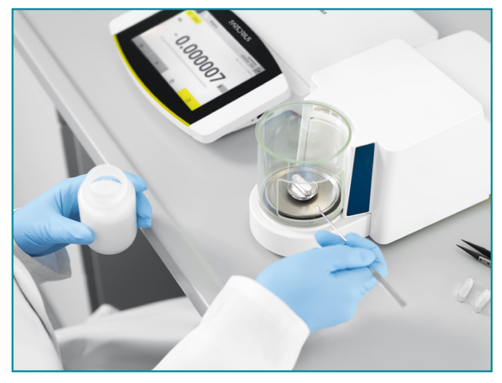
Figure 5. The proximity sensors are located on the left and right of the glass draft shield. The sensors detect the operator's hand and automatically open the draft shield, and close it when the hand is moved out of the sensor's detection range.

Ergonomics plays an essential role in accurate weighing of very small sample amounts. Transferring sample from a piece of weighing paper or foil into a vessel carries the risk of sample loss. Depending on the sample properties, a significant portion of weighed sample might remain on the paper or foil during transfer, leading to inaccurate sample preparation. Direct weighing into the vessel requires a specific set of accommodation from the balance unit. Balancing powdery or granular samples on a spatula and in parallel opening the draft shield manually is distracting for the operator. In regulated pharmaceutical industry settings where highly active substances are measured, this could not only fatigue the user, but also be dangerous. Sartorius's micro- and ultra-microbalances with glass draft shield have proximity sensors that detect the operator's hand in front of the weighing module and automatically open/close the smooth-action draft shield, facilitating fast and ergonomic work procedures (Figure 5).