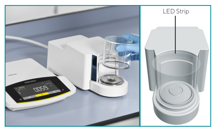
Figure 8. The crystal-clear glass and LED backlight illumination improve visibility of all the actions inside the draft shield. The LEDs are located in the weighing module and their intensity can be adjusted under the balance settings menu.

Another factor influencing sample weighing ergonomics is the visual workflow control. Sartorius's micro- and ultramicrobalances are equipped with a crystal-clear tempered glass draft shield plus LED backlight illumination. The LEDs are located in the weighing module and light the draft shield interior (Figure 8).