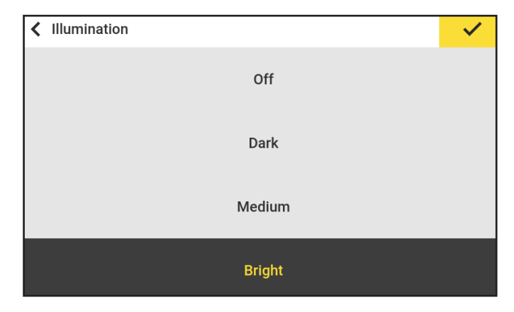
Figure 9. Settings menu for the LED intensity.

The illuminated draft shield allows for clear sample viewing and optimal handling of even the smallest sample amounts. For light sensitive samples the LED intensity is adjustable in three steps or can be switched off (bright, medium, dark, or off) (Figure 9).