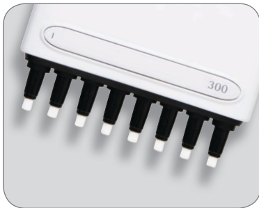
Safe-Cone Filters protect the pipette from contamination.

The exchangeable Safe-Cone Filters, used in pipette tip cones, act as barriers to prevent sample aerosols and fluids from contaminating the internal components of the pipette.