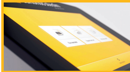
Figure 3: The bright screen of the Sartochek 5 filter tester is readable from all angles.

allows automatic detection of testing anomalies and operator errors both during or in advance of a test. That prevents time-consuming and costly deviations, potential drug recalls, and warning letters. A supplied comprehensive failure mode effects analysis (FMEA) can identify conditions that might generate false passes or fails, thus indicating to operators where existing controls or measures will require further strengthening. The FMEA also can analyze risks to operators when compressed gas is used for testing the device internally and externally and when moving such gases from one location to another. This documentation also includes directives and real examples for setting program-specific safety parameters to prevent false passed and failed.