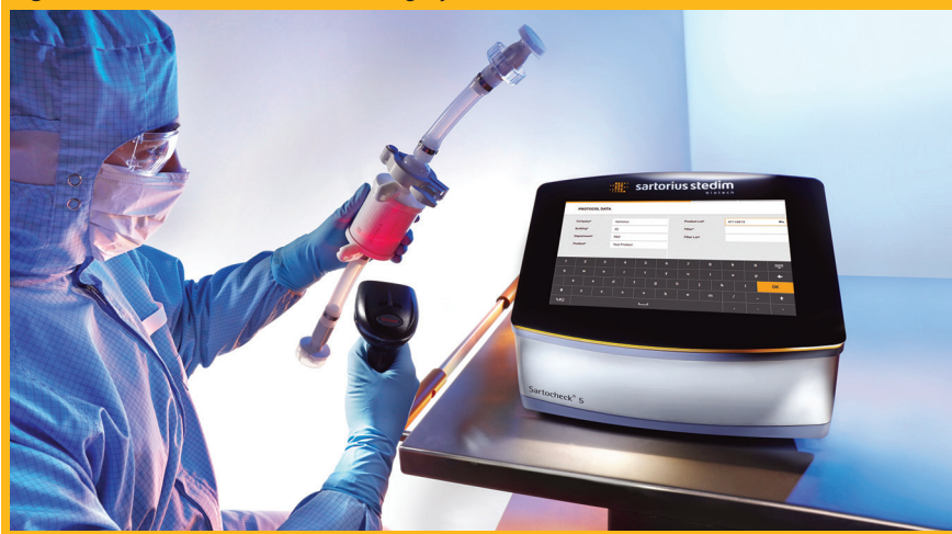
Figure 1: Sartocheck 5 Plus filter integrity tester

International Council on Harmonisation of Technical Requirements for Registration of Pharmaceuticals for Human Use (ICH) guideline Q9 (3), and the future Annex 1 will emphasize its importance further. Other widely used guidances from the UK Medicines and Healthcare Products Regulatory Agency (MHRA) and the US FDA (4, 5), along with recommendations from the Parenteral Drug Association (PDA), also align most regulatory bodies on this subject.