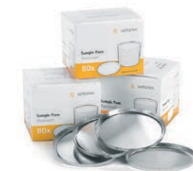
Disposable sample pans

* DAkkS = German accreditation body recognized throughout Europe