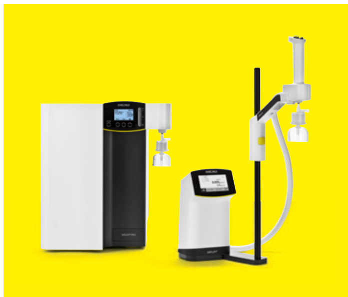
Supply ultrapure water from Arium® Pro and Arium® Comfort

The stepless height adjustment from 8.5 – 65 cm allows you to fill different sized containers. Thanks to its angular designed stand even bulky vessels can be optimally positioned under the dispense outlet. Depending on your needs you can adjust the volume dispense from 50 mL up to 50 Liter.