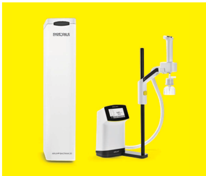
Supply pure water from Arium® Bagtank