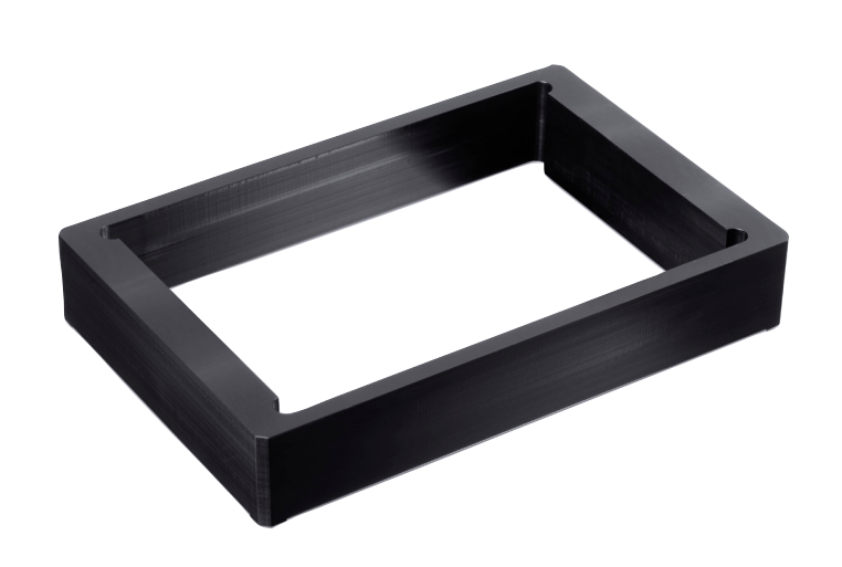
Ambr® 15 universal plate holder Part no. 001-8B46