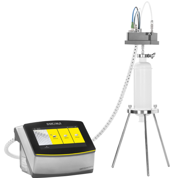
Setup of Accessory Kit for External Venting

The optional Accessory Kit for External Venting (AKEV) consists of a venting valve and a blocking valve and includes a pressure sensor that is identical to the one used inside the Sartochek ® 5. The kit can be used in conjunction with the Sartochek ® 5 to avoid any unwanted siphoning of liquid. This precludes cross -contamination between product-soaked filters being post-use tested and new filters being pre-use tested (e.g., PUPSIT).