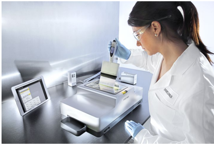
Figure 1: The SpeedCal mobile is connected via an Ethernet interface and can be operated without additional software

The highlight of Sartorius' pipette calibration solutions is the SpeedCal mobile system, a unique system designed for the calibration of multi-channeled pipettes. "This is the only pipette calibration balance where you can calibrate all channels in one step," explains Weber. He continues: "It is available with four, eight or 12 channels, with the option to subsequently add up to 12 channels. The 12-channel model, for example, contains 12 single weighing modules, meaning you can pipette the dose of every channel at the same time and the balance automatically checks the weight across each channel. This allows you to calibrate a 12-channel pipette according to ISO 8655 standards, with all 360 measurements, in just six to eight minutes."