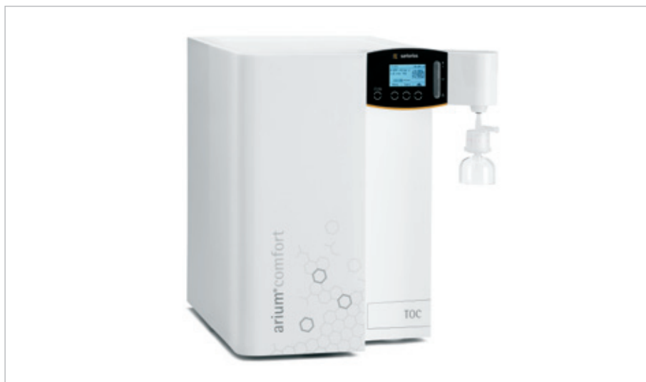
arium® comfort I with iJust